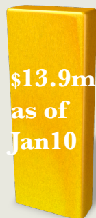
Chilean Temple Initiative Contributions