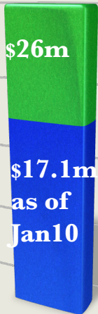
National Fund Contributions